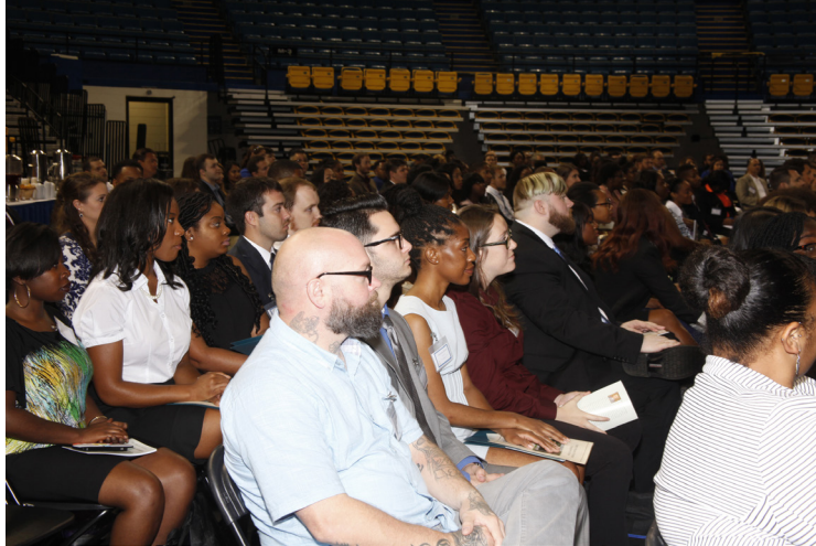
SULC Orientation, August 2017

While the Law Center does not prescribe any specific pre-legal preparation, it strongly recommends a foundation consisting of such courses as English, mass communications/journalism, public speaking, French, Spanish, accounting, psychology, logic, mathematics, and other analytical courses.