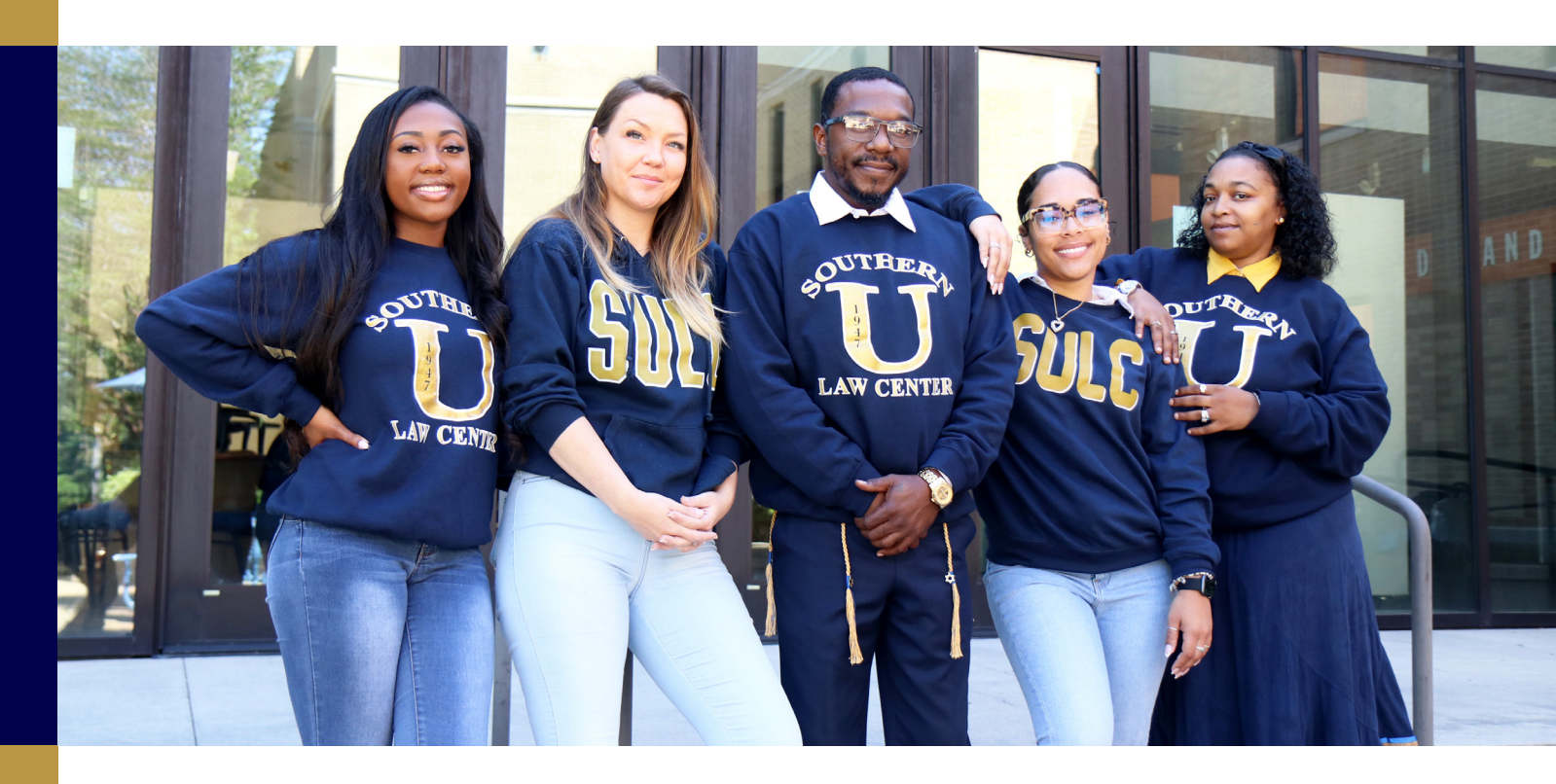
Producing Lawyer Leaders