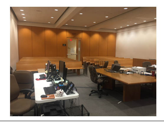
Harris County Criminal Court; Court 16 Dallas, TX

Throughout the duration of my externship I have been exposed to the many issues that plague the criminal justice system. One issue that has been addressed multiple times is the current federal law suit against Harris County Judges that involves Personal Bonds in Harris county And how they were essentially detaining poor people while releasing similar defendants who are capable of paying their bond. As a black man growing up in the inner city of Dallas, prosecutors are not looked at in a favorable light. Be that as it may, while working at the districts attorney office it has allowed me to experience and witness how pivotal prosecutors are in the criminal justice system. With family violence being an issue that plagues many homes, the district attorney's office serves as a bridge for individuals in situations in which they are unable to help themselves. Working in the misdemeanor division, family assaults appear often. Still recovering from hurricane Harvey, although the district attorney's office is scattered throughout Houston they have been able weather the storm before and after Harvey. On a daily basis I assist prosecutors in witness interviews, preparing the bond docket and jail docket, and ensuring evidence is properly secured.