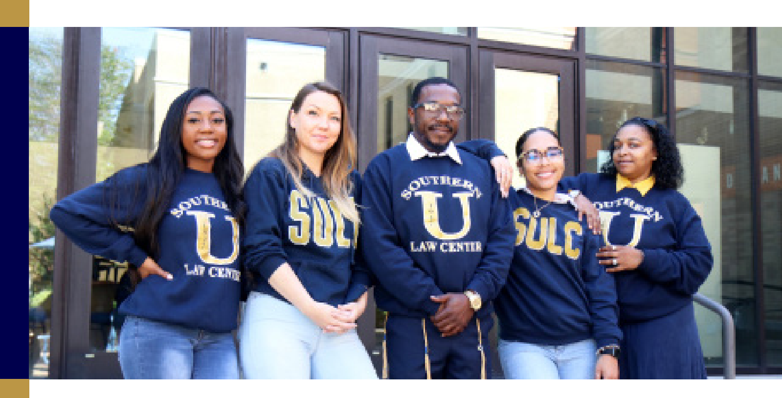
Producing Lawyer Leaders