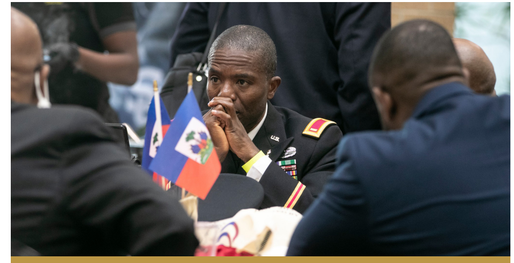
The unity summit was established to encourage all Haitian political factions to arrive at a lasting solution to Haiti's intractable political crisis.