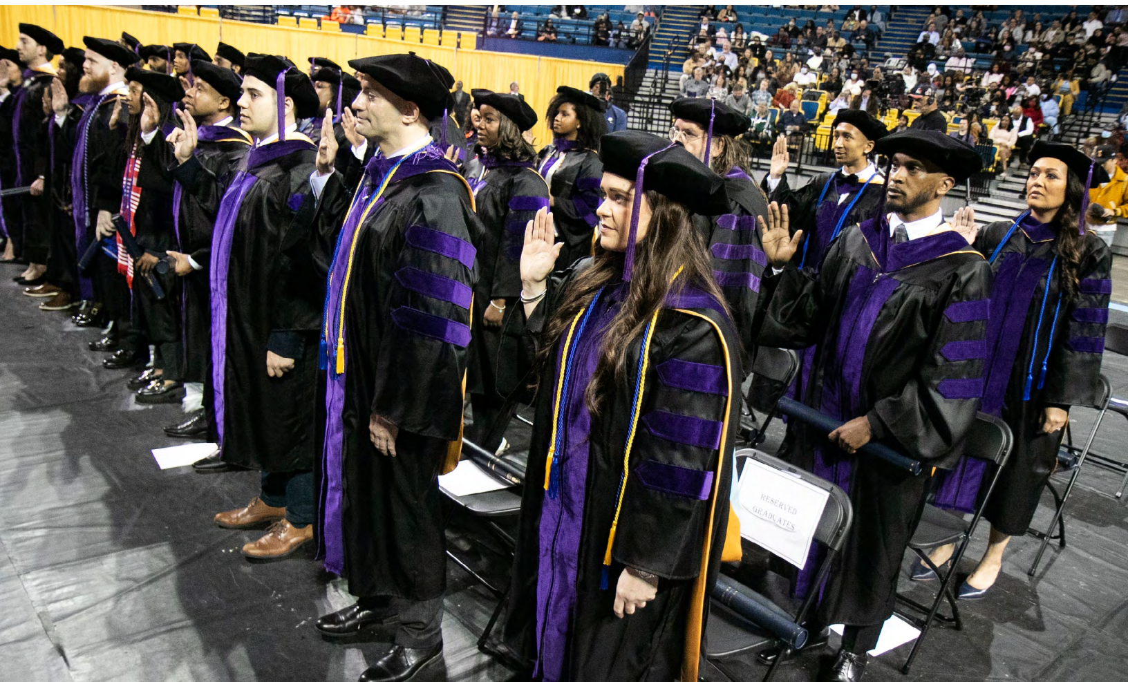
SULC Fall 2022 graduates