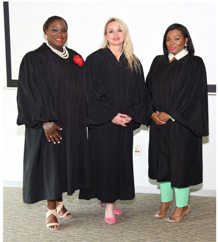
(Left photo) SULC 2023 Distinguished Alumni honorees; (Right photo) SULC 2023 Judicial Wall of Fame honorees

The Southern University Law Center (SULC) welcomed its alumni and friends for a week of recognition, reconnection and networking at the annual Alumni and Friends Round-Up that took place March 30- April 1.